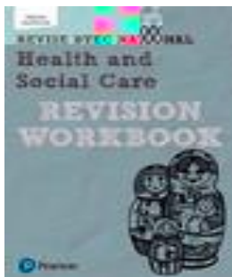
Revise BTEC National Health and Social Care Revision Workbook