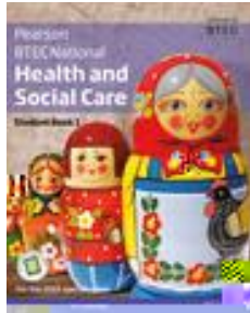
BTEC National Health and Social Care Student Book 1